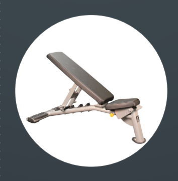
30°Incline (Decline seat)